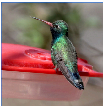
Broad-billed hummingbird