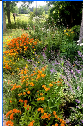
A native plants garden is lush and colorful.

conservationist and professor in the Department of Entomology and Wildlife Ecology at the University of Delaware, there are four functions or goals that every homeowner’s landscape and yard must perform to produce a healthy and viable ecosystem that we all need: