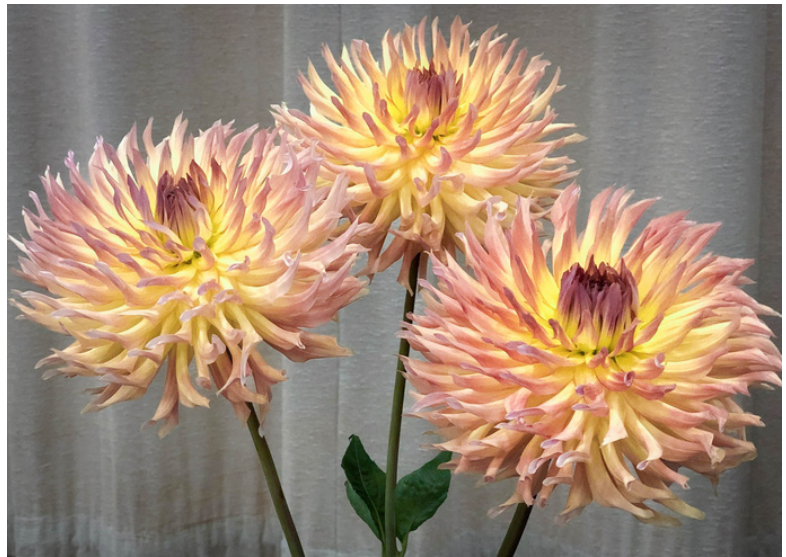
Allen's Battle Angel