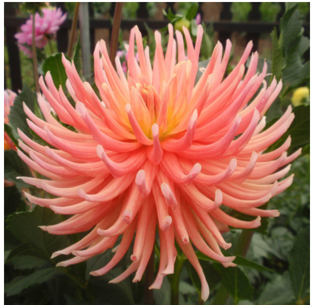
Hollyhill Peachy Keen

To avoid confusion, rename your photo files so that they indicate the cultivar. The preferred format is: classification number_variety name_year photo was taken.file format