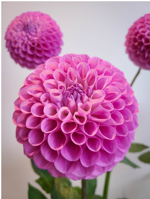
20th Ave Old Major