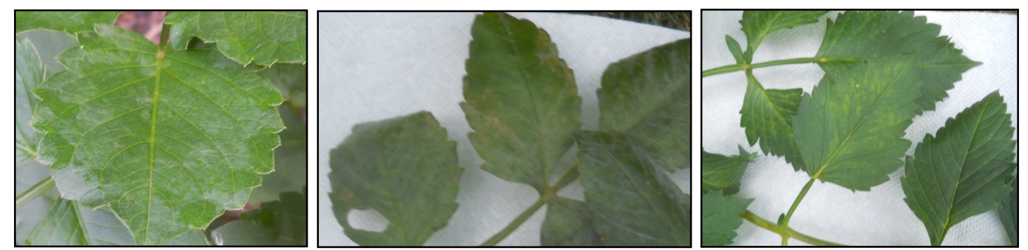
Figure 2: Photographs of the foliage of the three lowest rated samples analyzed. Although each of the samples was rated as 2, the problems with the foliage are not easy to see in a photograph.

It became clear that a quantitative characterization of the quality of the appearance of the foliage would be a very useful tool in analyzing the results of the virus tests. An arbitrary scale of rating was created that treated leaves with no